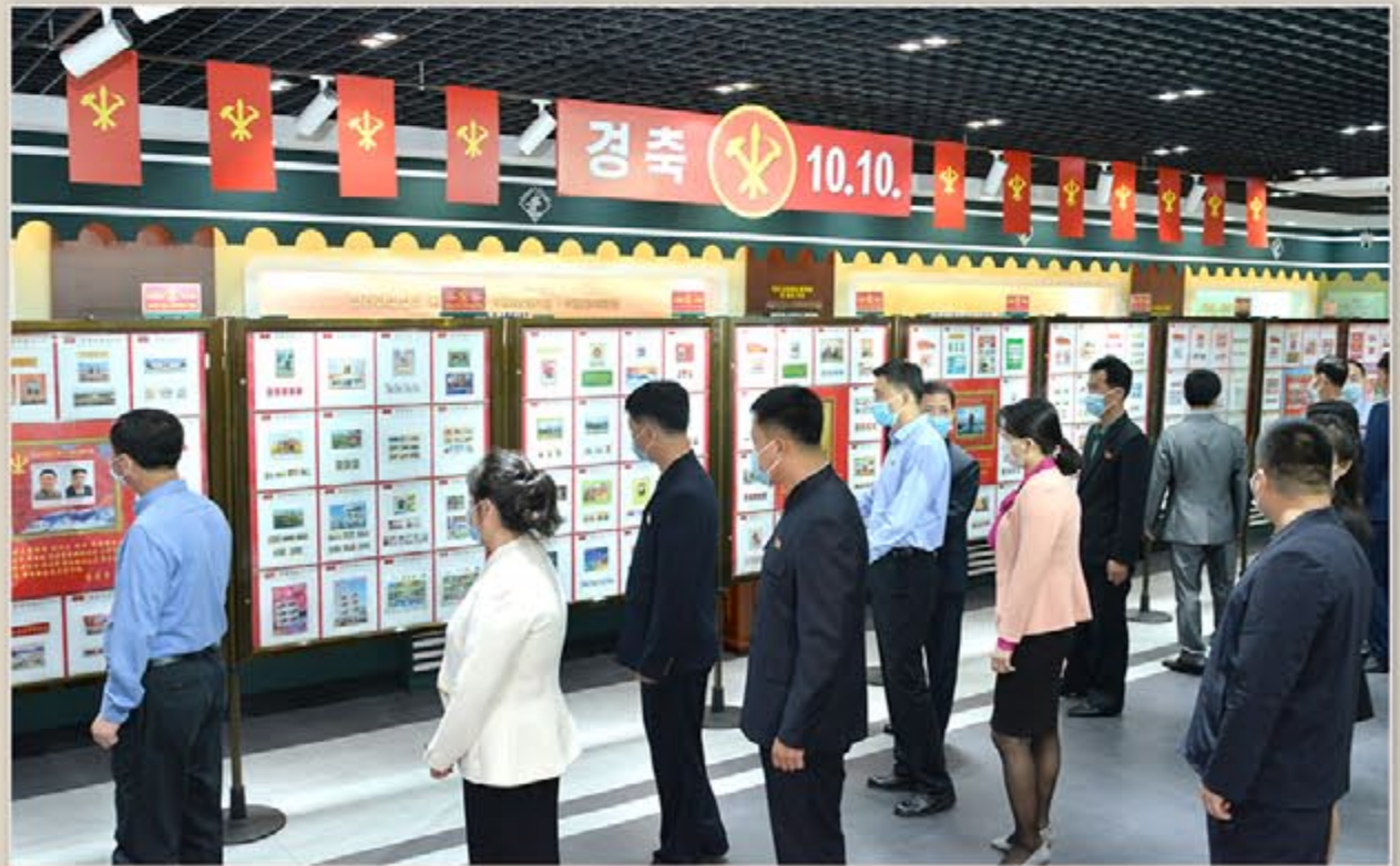
National exhibitions of books, industrial art designs and Korean stamps