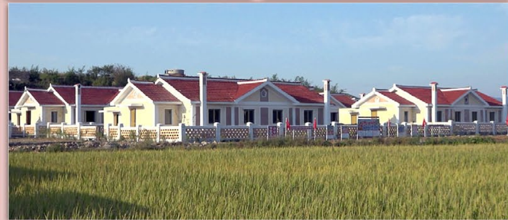
Flood victims moved to new houses on the eve of the October holiday