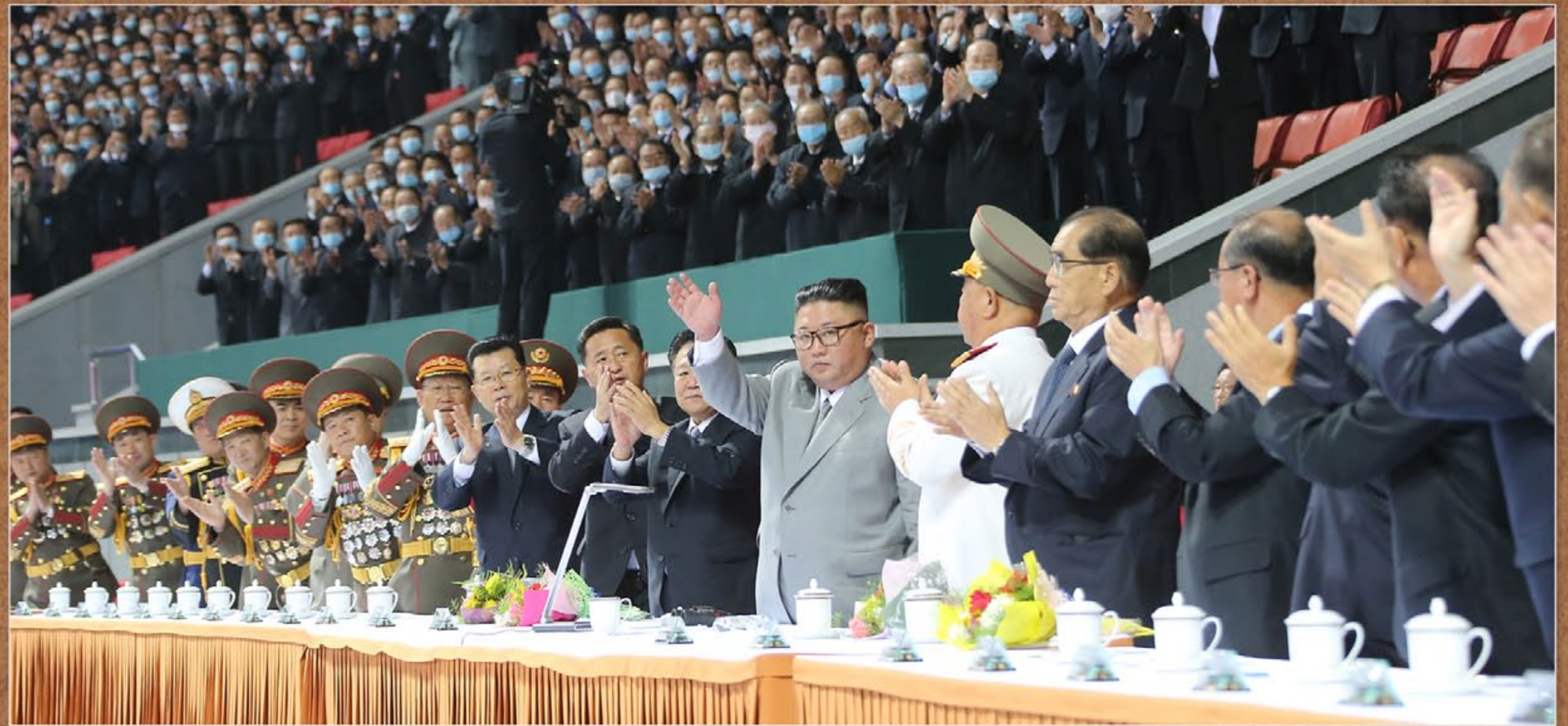
Supreme Leader Kim Jong Un waved back to the performers of the grand gala and the audience in October 2020