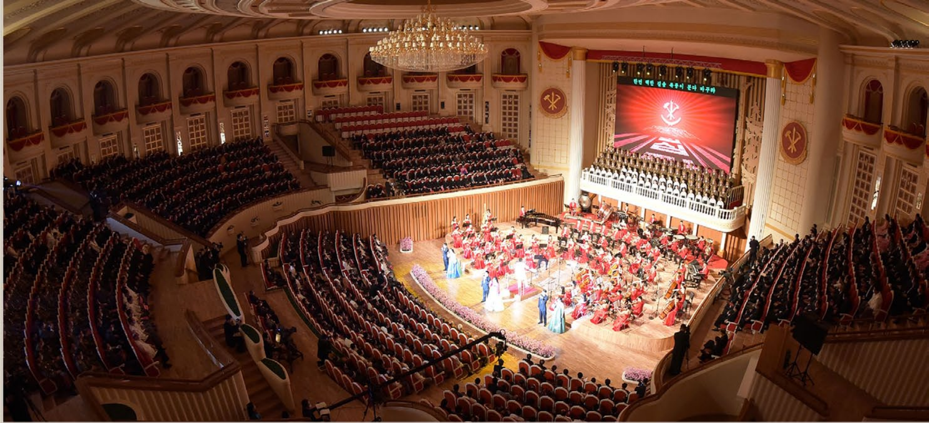
Performance of the Samjiyon Orchestra