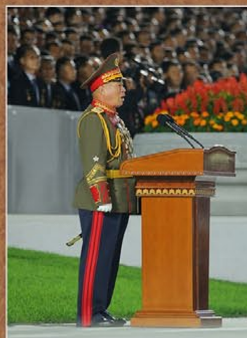
KPA Marshal Pak Jong Chon, chief of the KPA General Staff, ordered the columns of the armed forces of the DPRK to start the military parade

Amid the playing of song The Glorious Motherland , a 21-gun salute was fired to mark the WPK anniversary.