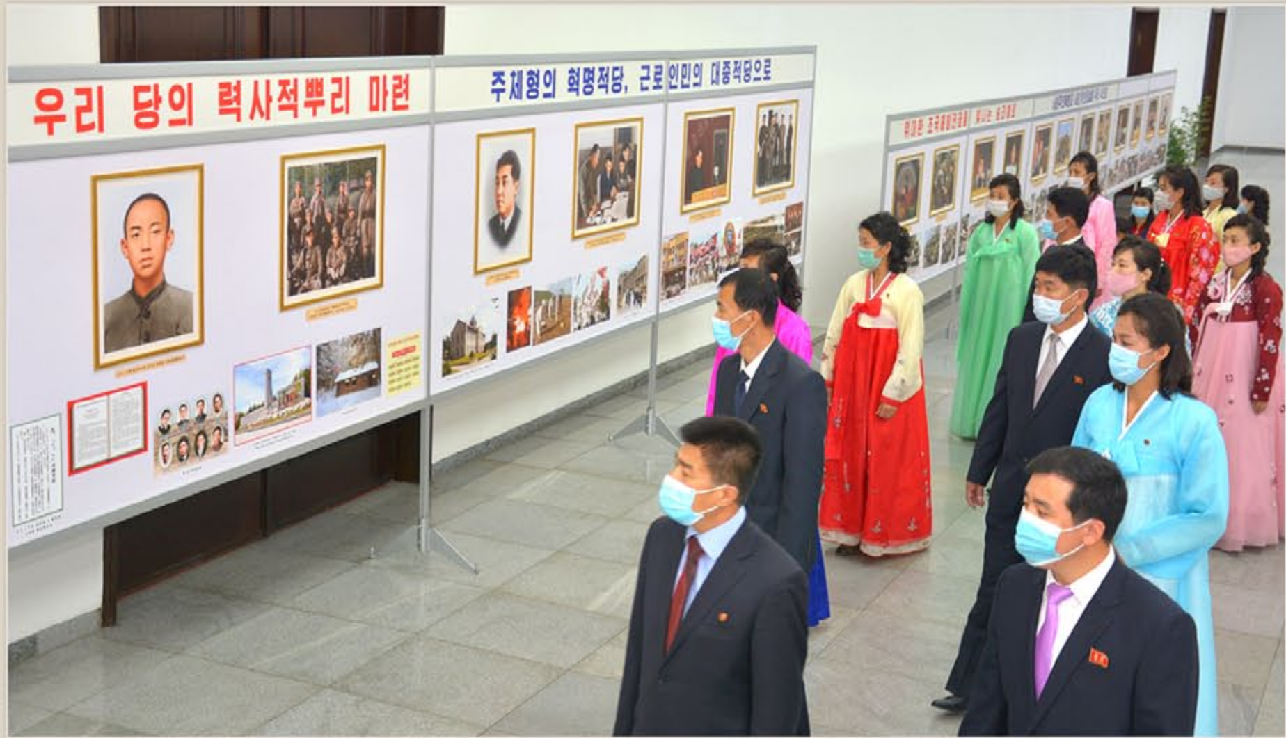
National photo exhibition