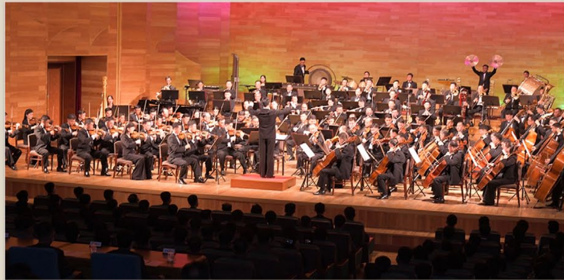
Joint performance of the Mansudae and Wangjaesan art troupes and concert of the National Symphony Orchestra