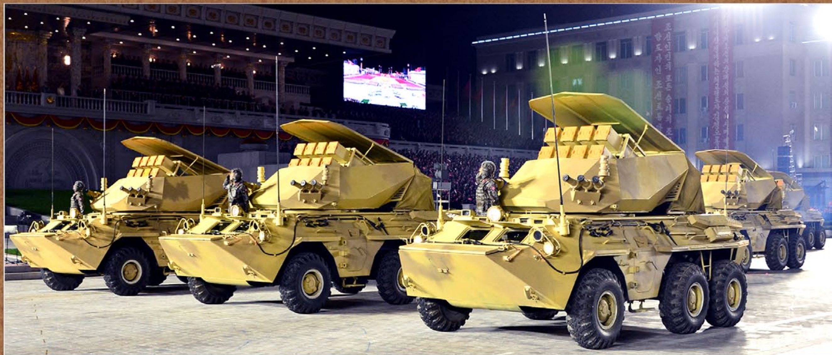
Columns of mechanized units began their procession led by the column of armoured vehicles

of pride of the armed forces of the DPRK.