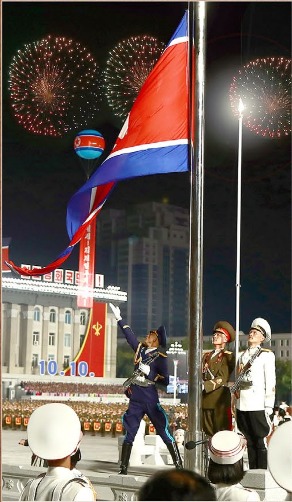
The national flag was hoisted amid the playing of The Patriotic Song