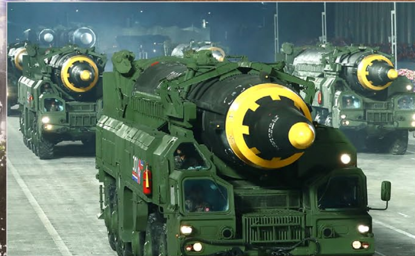
Columns of ICBMs demonstrate the dignity and strength of the DPRK