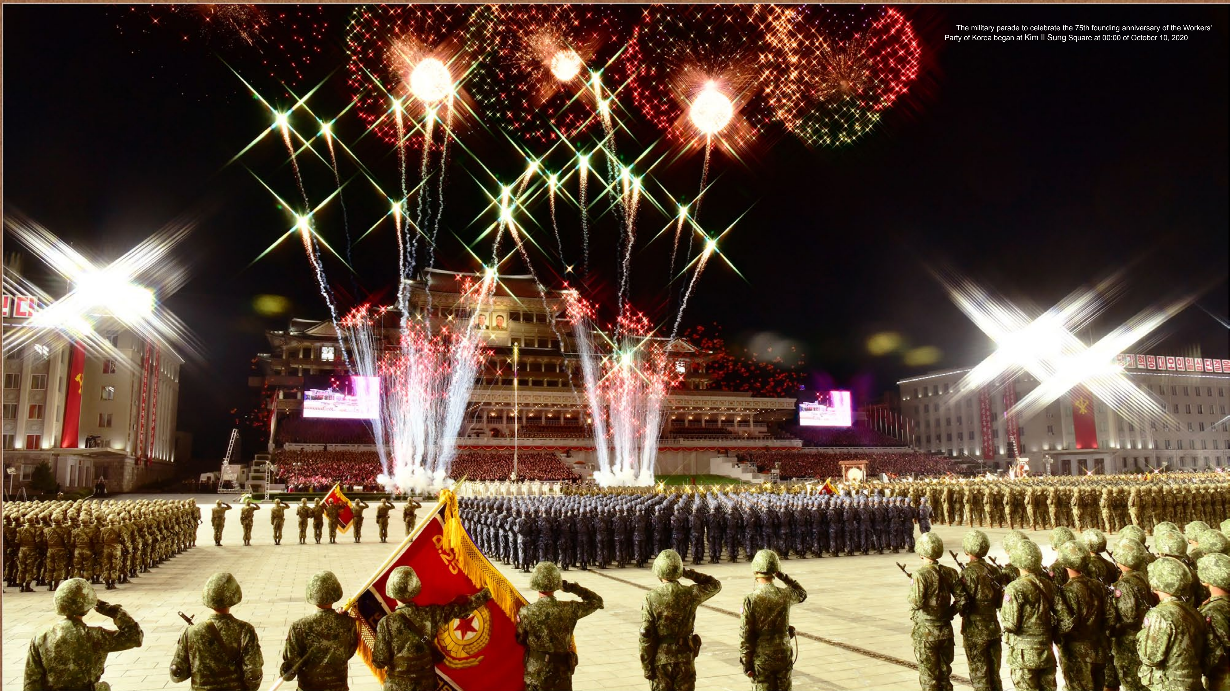
The military parade to celebrate the 75th founding anniversary of the Workers' Party of Korea began at Kim Il Sung Square at 00:00 of October 10, 2020