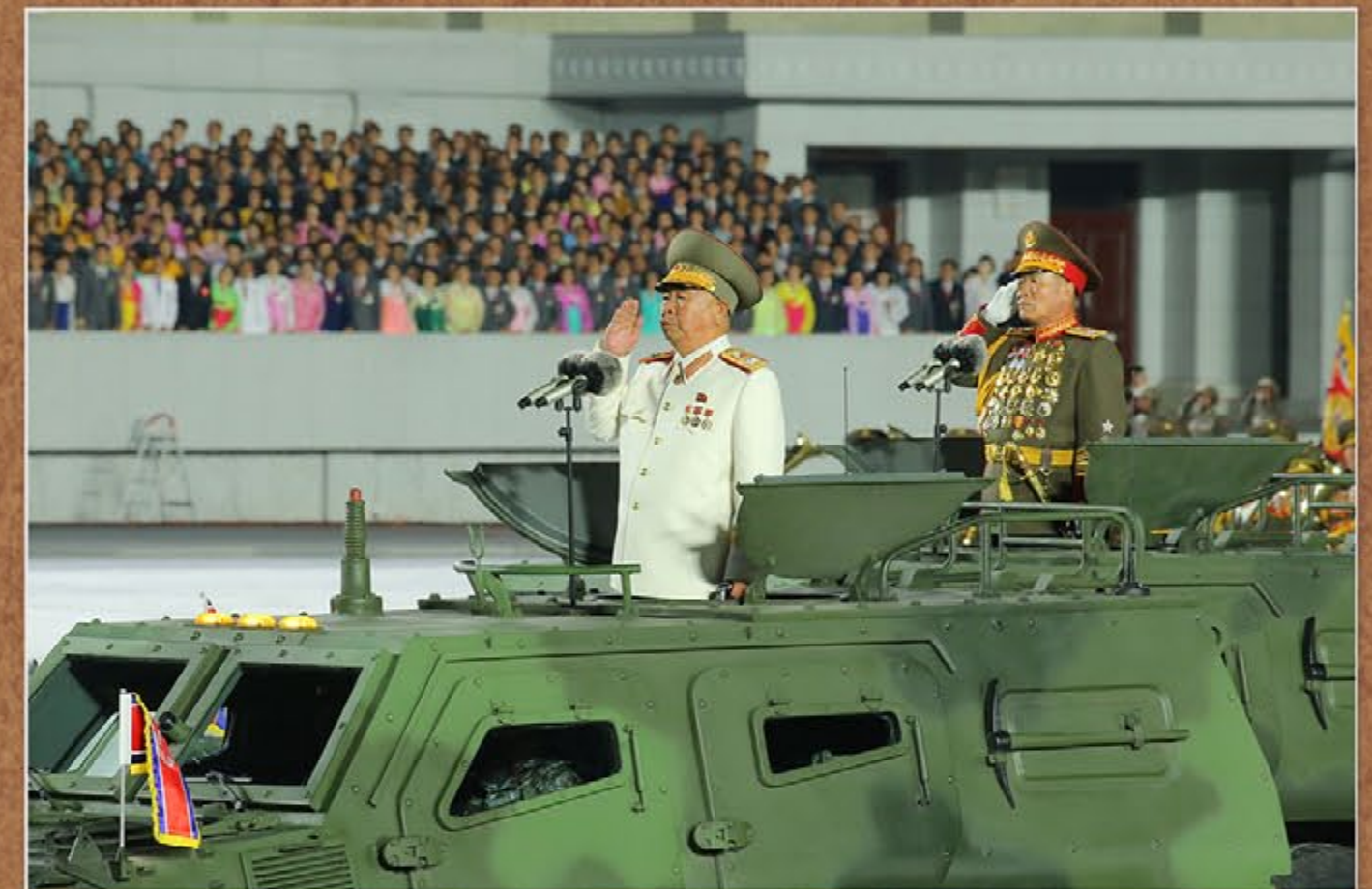
KPA Marshal Ri Pyong Chol, vice-chairman of the Central Military Commission of the WPK, reported to the Chairman of the WPK that the military parade was ready to start

On the order of Marshal Pak Jong Chon, chief of the