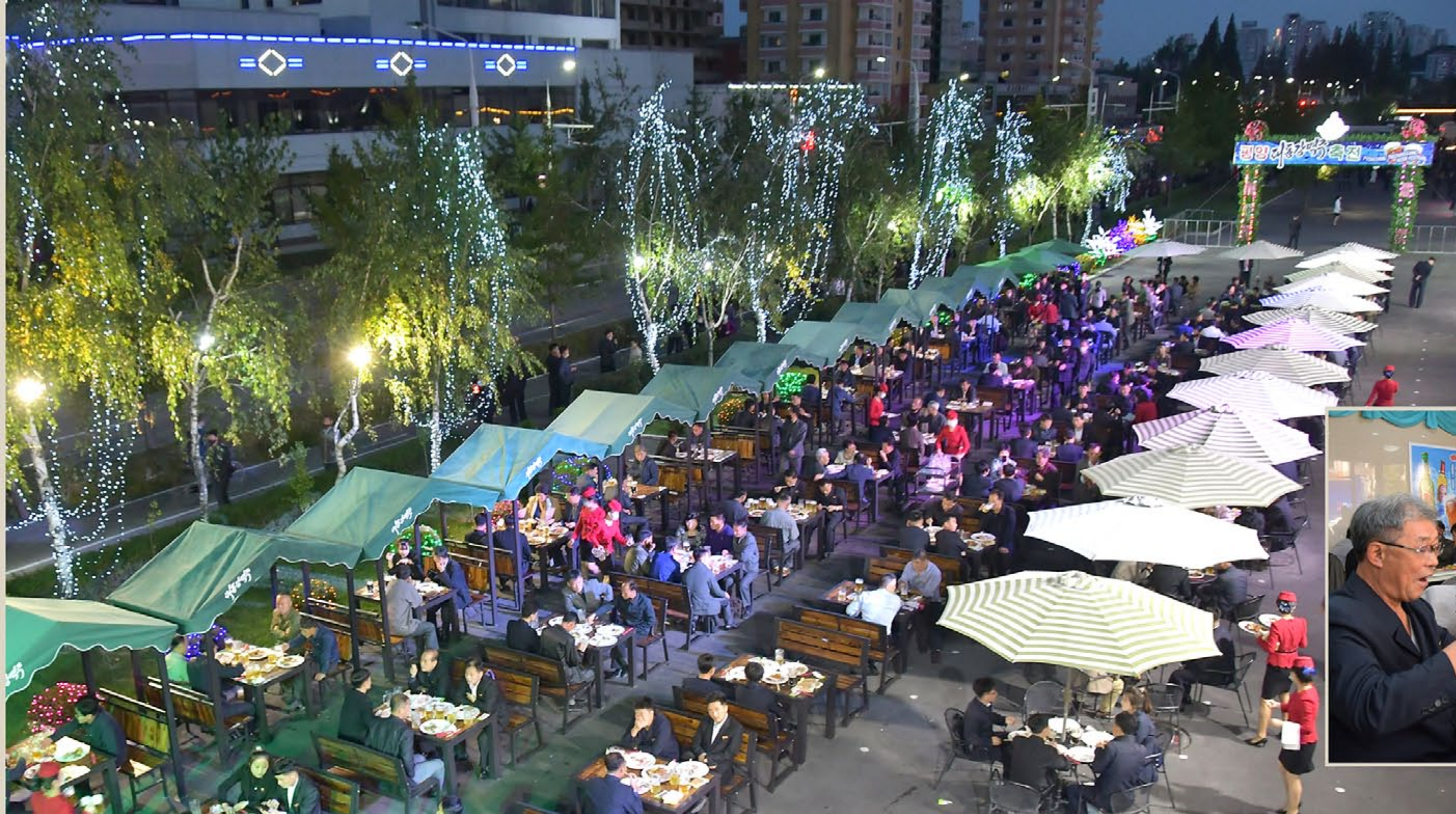
The Pyongyang Taedonggang Beer Festival took place