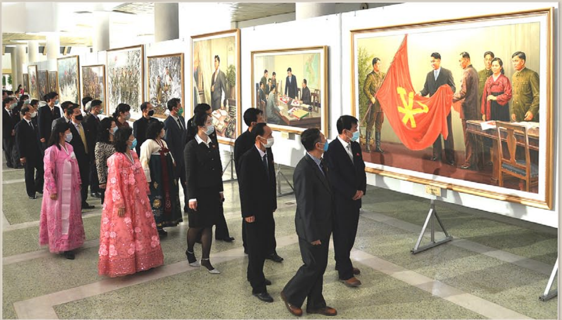
National art exhibition

All the Korean people celebrated the 75th birthday of the Workers' Party of Korea significantly. Officials, working people and service personnel visited the Kumsusan Palace of the Sun where President Kim Il Sung and Chairman Kim Jong Il are preserved in their lifetime appearance, statues of the great leaders on Mansu Hill, the statues and pictures of their beaming images in other parts of the country to pay a tribute.