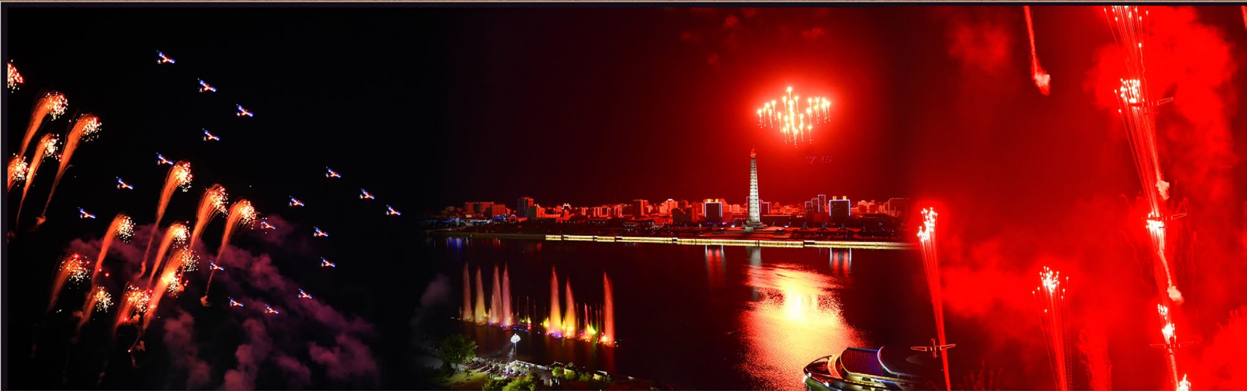
There was a flight in the sky above Kim Il Sung Square, demonstrating the invincible might of the Juche-oriented air force